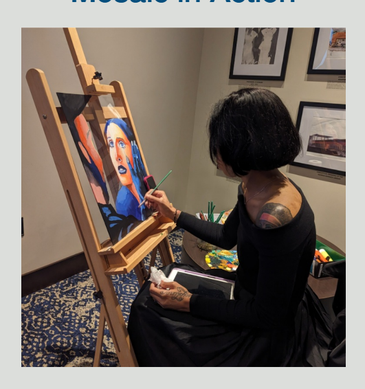
Our Best Masterpieces Yet!